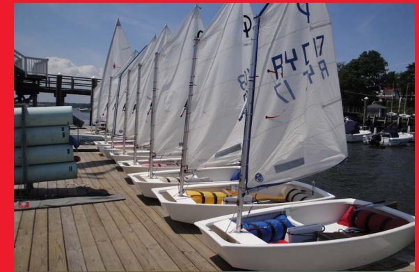
Optis ready for junior sailing program