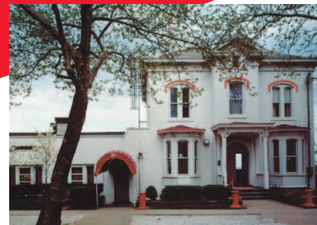
Club Main Entrance

Raritan Yacht Club 160 Water Street Perth Amboy, New Jersey 08861 732-324-8460 www.ryc.org