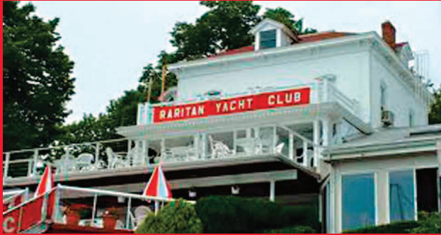
Raritan Yacht Club upper deck