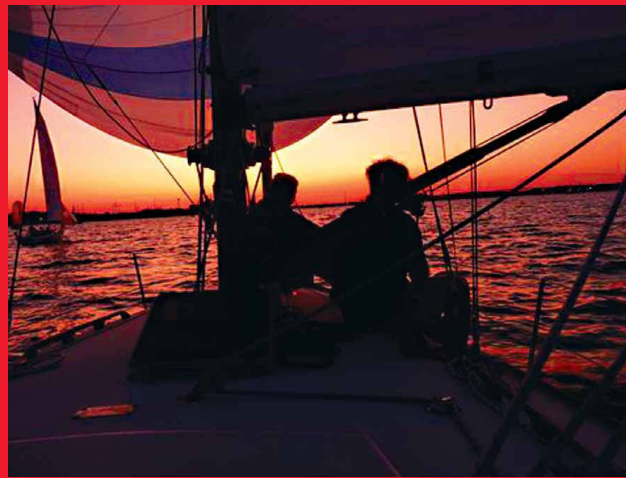
A sunset sail on Raritan Bay

Raritan Yacht Club enjoys an active education and entertainment committee that provides events throughout the year. The events feature theme parties, live music on the deck, holiday parties for adults and children, the annual New Years Eve dinner dance, regatta celebrations, educational speakers and much more.