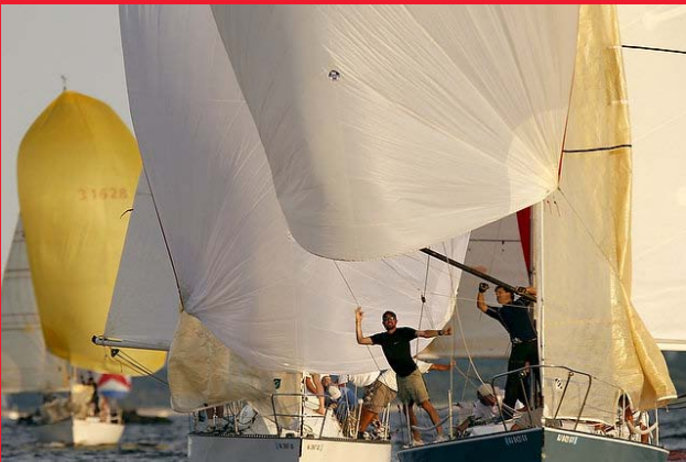
Wednesday night racing