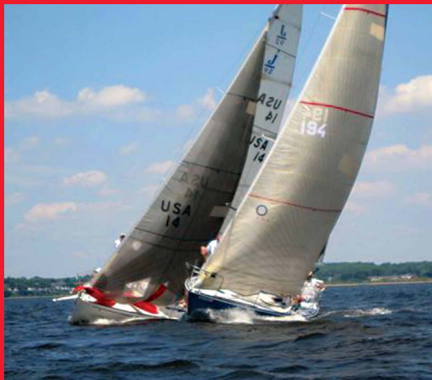
Wednesday night sailboat racing on Raritan Bay

Raritan Yacht Club 160 Water Street Perth Amboy, New Jersey 08861 732-324-8460 www.ryc.org