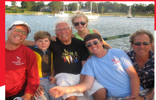
Sailing on Raritan Bay