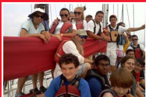
Cruising Port of Call-Essex, Connecticut