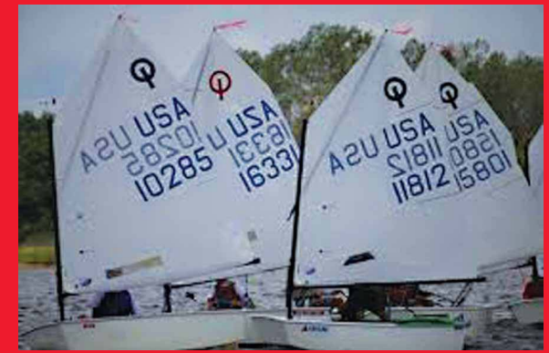
Junior sailing at RYC

The cruising contingent from Raritan Yacht Club continues to expand. The summer sailing season at Raritan Yacht Club features day cruises to ports on the Bay and longer overnight cruises to other harbors. The cruises are led by a cruise captain and well planned for easy participation. Participants enjoy raft-ups and dinners in different ports. There is always something for every family member!