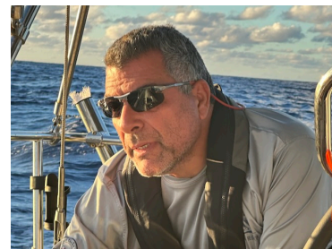
VC Rugulo challenges the auto pilot to a steering contest

This year's voyage offered the entire gambit of off-shore fun from dead calm & flat seas to 25 knot trade winds with 8-10 ft swells. The 11 day, 1400 nm trip served up 2 days of motoring with sails furled, 3 days under a code zero and a finale featuring 1st and 2nd reefs. Add to the mix an assortment of daily squalls, which had the uncanny knack of appearing like clockwork right at the start of one of our unfortunate crew member's watch, and one gets a taste for extended trips on the open ocean.