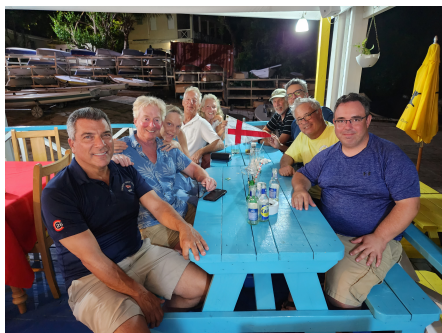
RYCers in Antigua

All good things come to an end and generally sailing adventures culminate with a large feast featuring small, measured servings of alcoholic beverages. In keeping with that time honored tradition, participant RYCers gathered to share a meal, swap salty yarns and regale each other with tales of high seas derring-do.